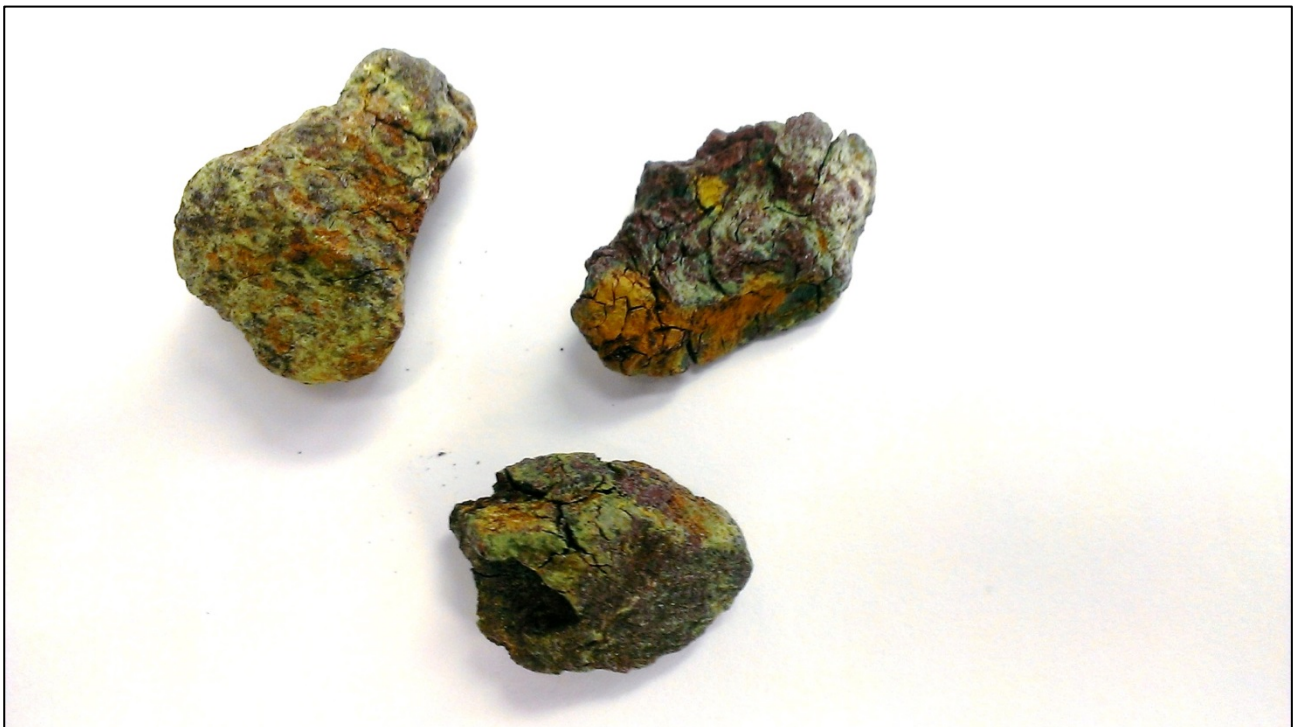
Figure 1: Nickeliferous gossan, containing the mineral gaspeite (Ni,Fe,Mg)CO 3 , from aircore hole FEAC278 at the Sabre prospect. Gaspeite is known from only a handful of locations worldwide. Aside from its type locality in Canada, gaspeite is found in the nickeliferous gossans of Kambalda type komatiitic nickel ore deposits in Kambalda, and nearby Widgiemooltha Townsite, both south of Kalgoorlie, Western Australia