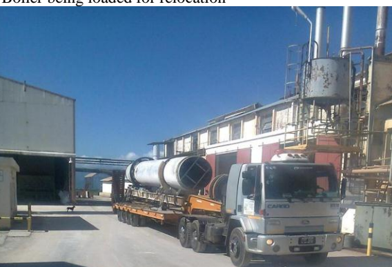
Boiler stacks being removed and loaded for relocation