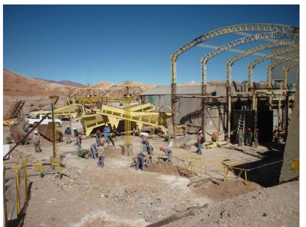
Part of the journey at Tincalayu

The relocation of the borax plant to the Tincalyu mine site will have significant benefits through both the reduction of operating unit costs and also increasing overall mineral recovery from the mine. Historically, run-of-mine ore at 17% B2O3 has been concentrated at Tincalayu using dry magnetic separation to produce a 21% grade which is then transported 350 kms from Tincalayu to Campo Quijano for production of borax chemicals. Recovery through the dry magnetic separation plant has previously been only approximately 60%. When the borax plant relocation to the Tincalayu mine site is complete the borax plant will treat run-of-mine ore without the use of the magnetic separation plant. This will result in: