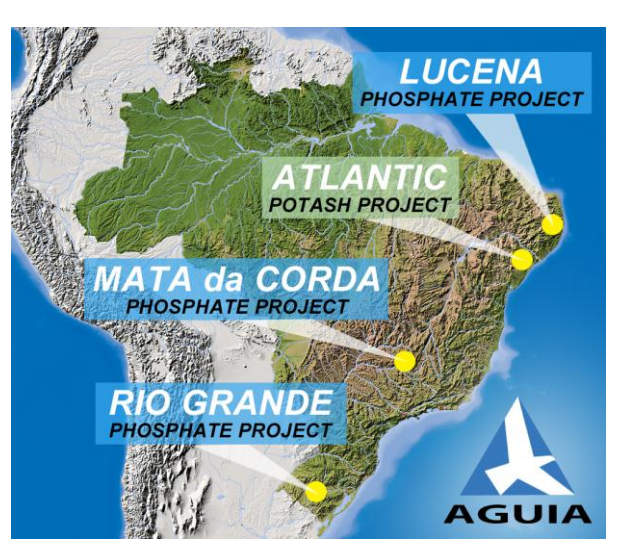
Figure 2: Location of Aguia Projects, Brazil