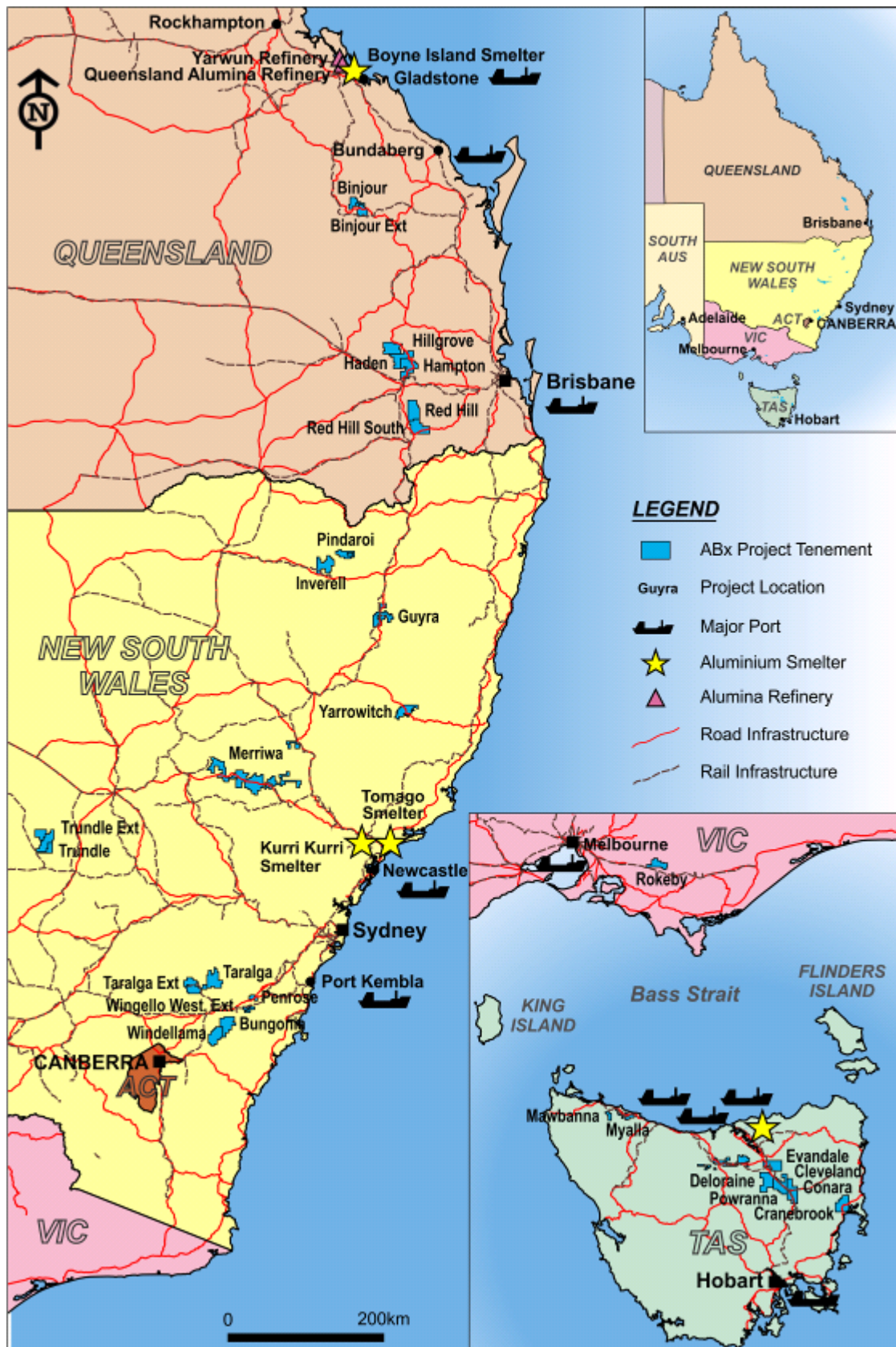
ABx Project Tenements and major infrastructure – January 2011