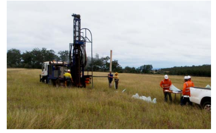
Figure 4 - Field operations, Queensland