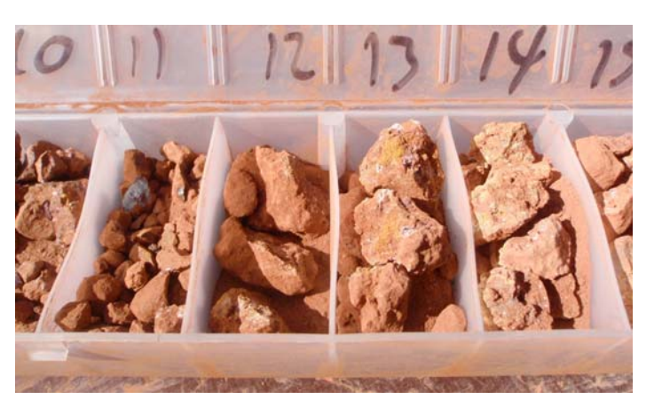
Figure 3 – Bauxite chips from depth interval 10 – 15m

A second-pass drilling program is underway so that a second plateau with bauxite can be tested and to do some infill drilling so that continuity of thickness and grades can be assessed for both areas. Bauxite at Binjour is extensive and the