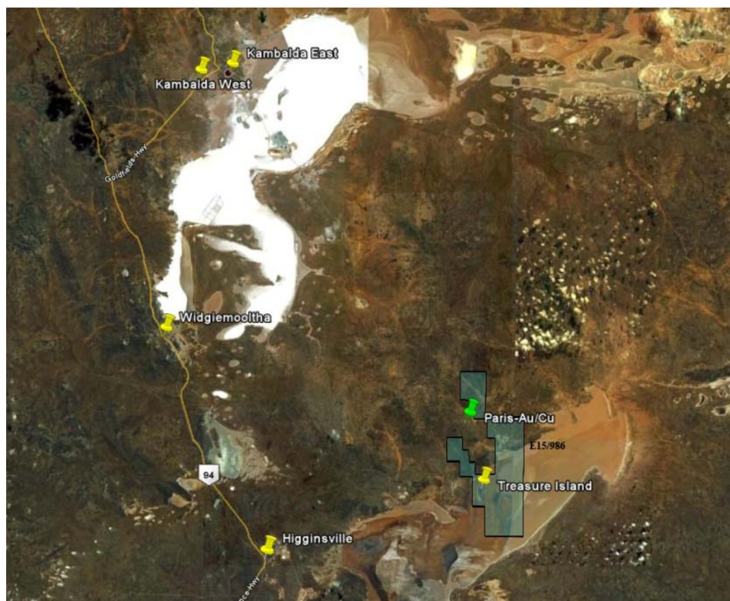
Figure 1 – E15/986 Locality Map