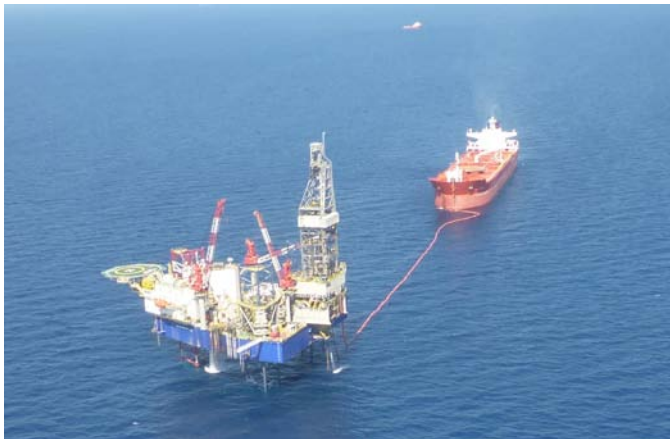
Surface Production, processing and oil storage facilities The "Aquamarine Driller" and "Tove Knutsen"

This follows the conclusion of well completion operations on the Tindalo-1 oil well earlier this week and final hookup and function testing of the surface production equipment.