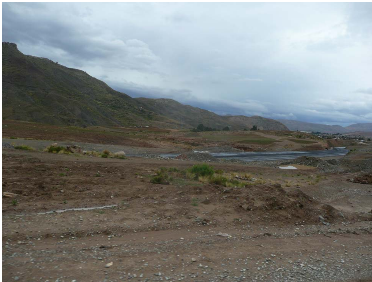
FIGURE 1 – PORTION OF NEWLY BITUMINISED ROAD NEAR LLALLAGUA