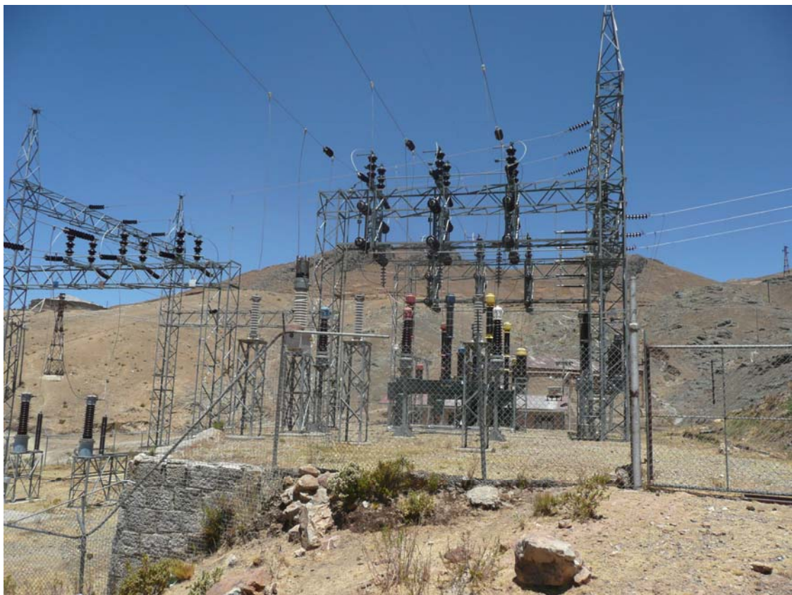
FIGURE 3 – ELECTRICITY SUB-STATION IN LLALLAGUA