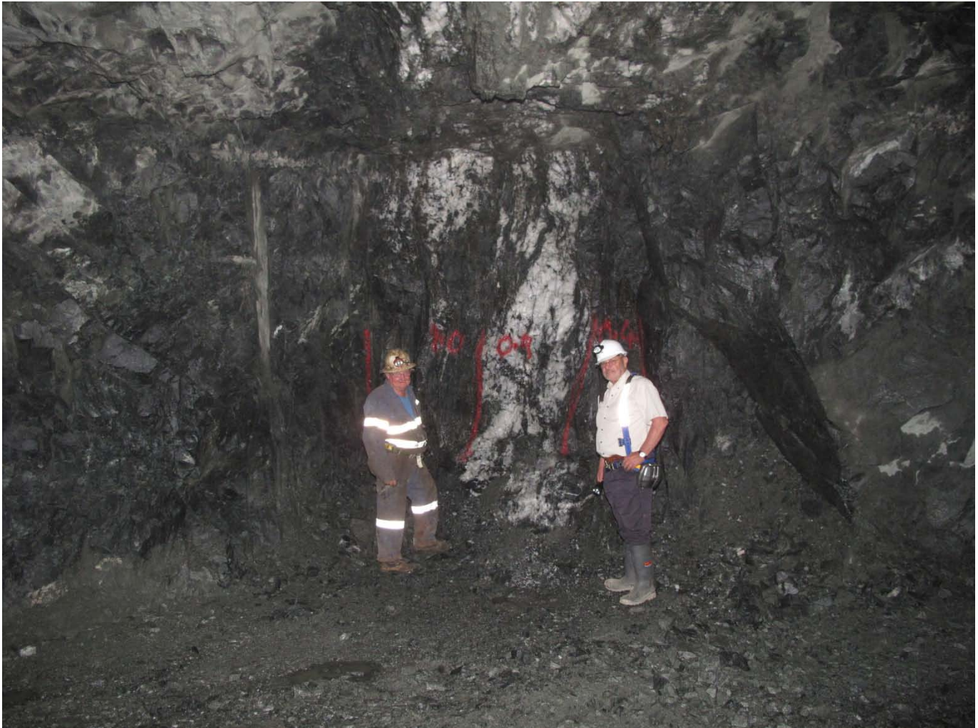
Figure 1: First intersection of the German lode. Face sample across 2 metres of 13.46 g/t.