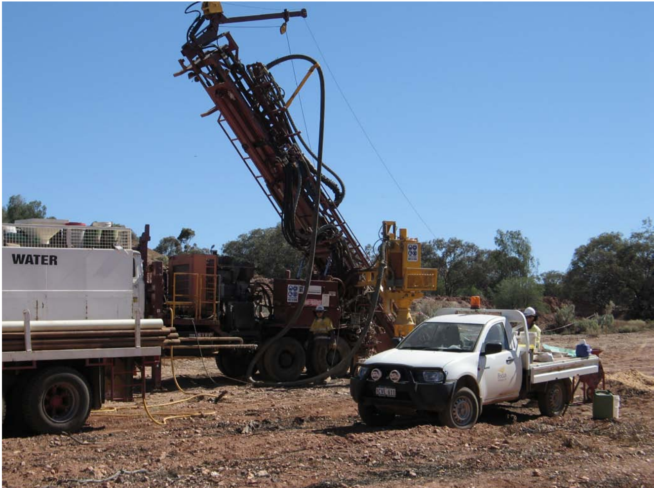
Figure 3: Newly mobilised surface drill rig operating at the Big Blow deposit