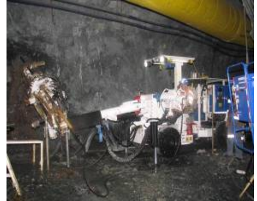
Diamond Drilling at Perseverance

An electromagnetic geophysical anomaly, located 100m north of the existing Perseverance deposit will also be targeted in this phase of exploration.