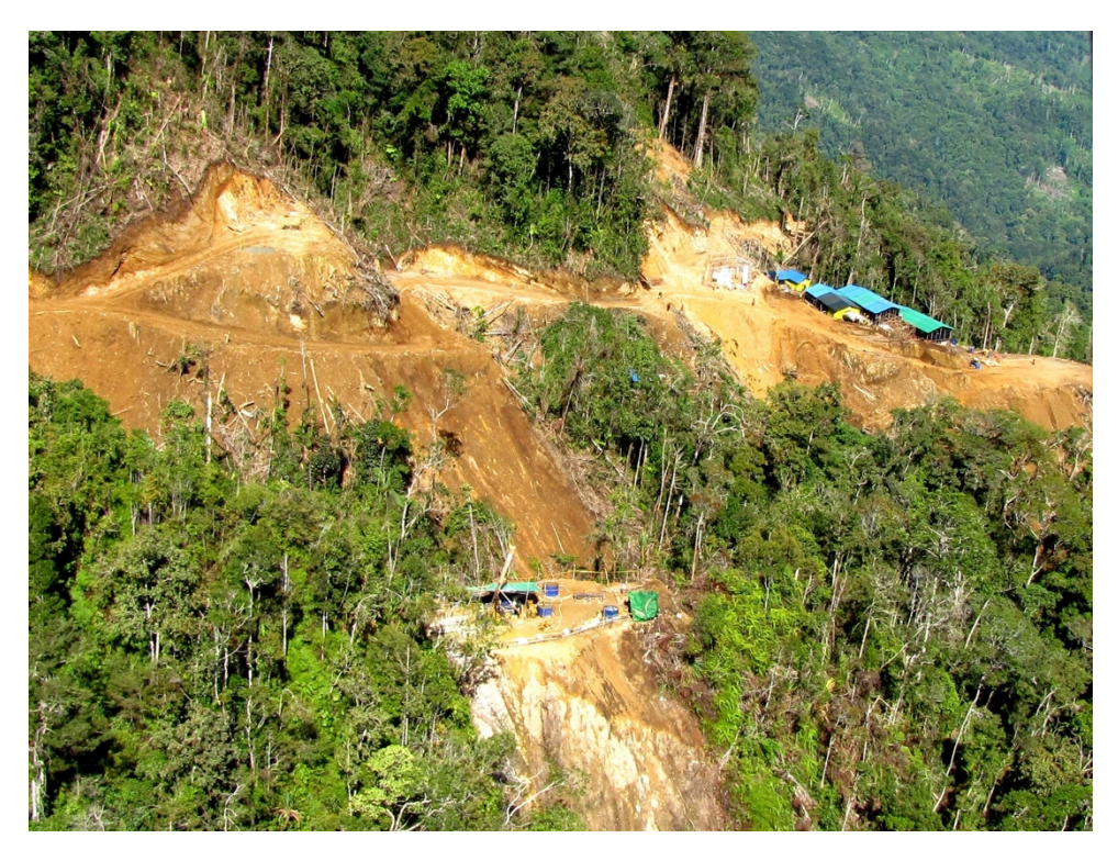
Drill rig on NEV 019 (foreground) with NEV 018 pad (top left) and new top camp (top right)