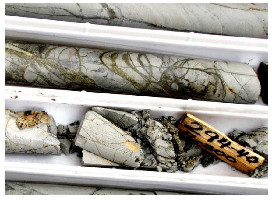
NEV 019: part of 294 to 296m: 2m at 16.43 g/t Au (average of 3 assays)