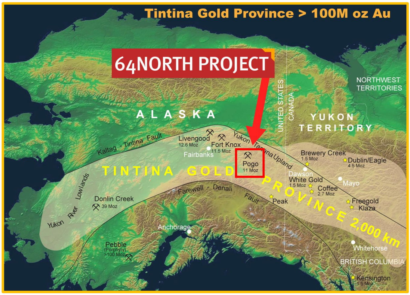
Figure 3 Deposit sizes stated as Endowment (Resources & Reserves + Historic Production) *sourced from Company websites

"The 64North Project is Resolution's flagship project which contains a pipeline of prospects each of which is in reality a project in its own right, namely West Pogo Block/Aurora Prospect, East Pogo Block and the E1 Prospect."