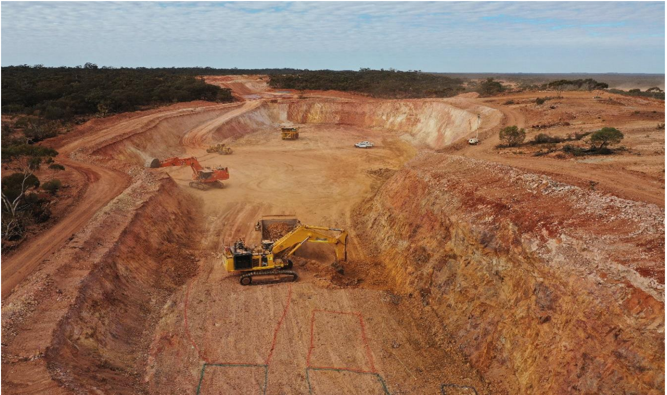
Figure 2: Mining high grade ore blocks in the Regal East pit

The next milling campaign comprising higher grade ore parcels from the Regal East and Regal West pits is scheduled for commencement in late August. The ore parcel from the Crown Jewell pit is scheduled to commence in October.